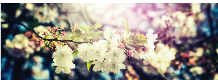
Blossoms