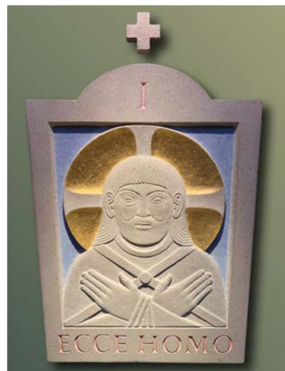
1. Jesus is condemned

To read more of the history of the Church of the Holy Redeemer go to: www.holyredeemerschelsea.com