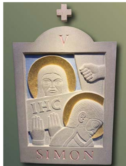
5. Simon helps Jesus