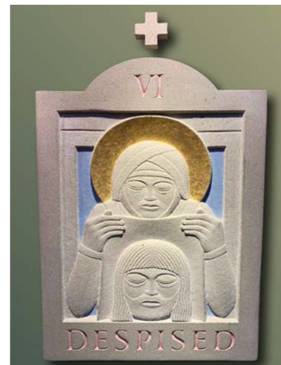
6. Veronica wipes Jesus' face