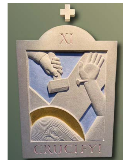
11. Jesus is nailed to the cross