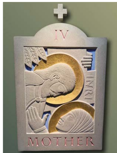
4. Jesus meets his mother