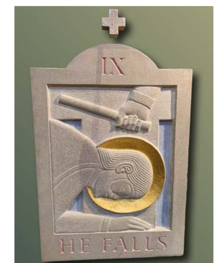
9. Jesus falls the third time