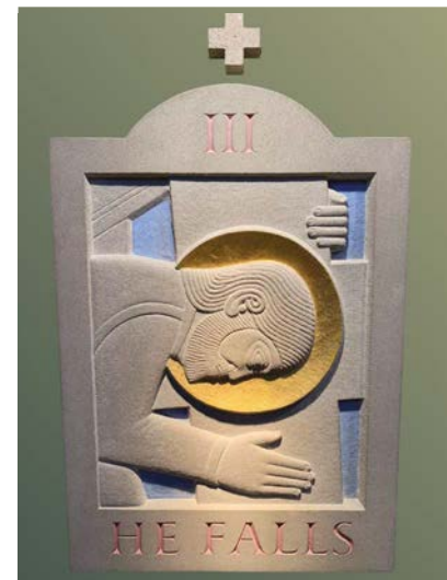
3. Jesus falls the first time