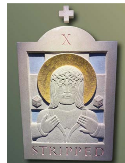
10. Jesus is stripped of his garments