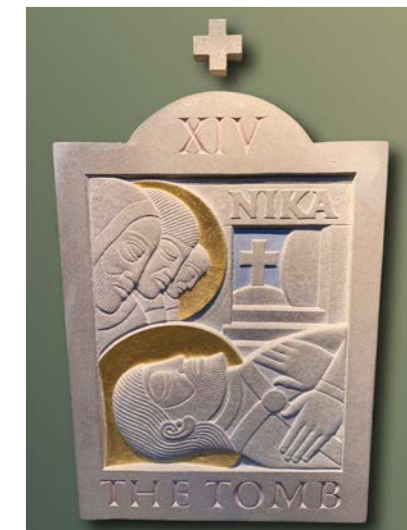
14. Jesus is laid in the tomb