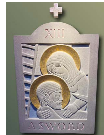
13. Jesus is taken from the cross