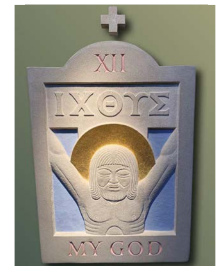
12. Jesus dies on the cross