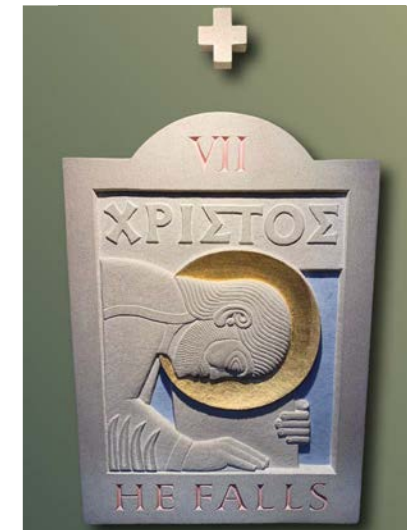
7. Jesus falls the second time