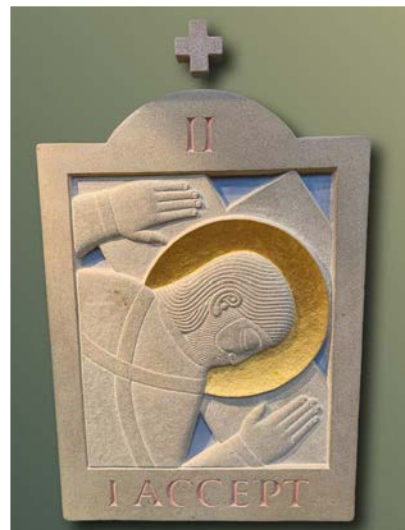
2. Jesus receives his cross