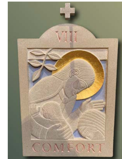
8. Jesus meets the women